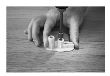
The head of the screw will hit the top of the fixture. The screw will then pull and snap at the score.