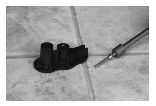
The screw is now set 1/5 of an inch below the floor. Take a hammer and tap the small bump that is left to smooth out the hole and force the hole to fill over.