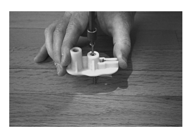
Drive a screw through the shorter opening in the fixture.