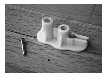
The score is now set 1/5 of an inch below the wood. Fill the hole with putty to finish.