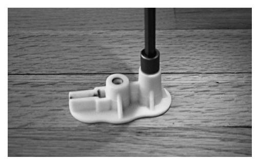
Drive the screw down as far as the fixture will allow.