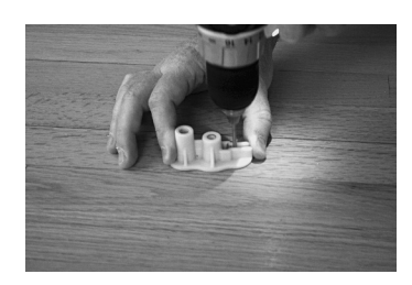
Pre-drill a hole in the floor with a 1/8 inch drill bit down 2 1/4 inches.