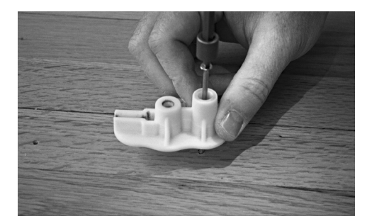
After pre-drilling a 1/8 inch hole down 2 1/4 inches, drive a screw through the taller opening in the fixture.