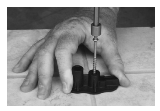
Once you find the joists, focus on the spot on the joist where the movement and squeaks are coming from. Then drive the screw through the shorter opening in the fixture.

In most linoleum floors you can find the floor joist with an electric stud sensor. The indications from the stud sensor may be weaker although you should be able to get a good idea where the joists are. Using a strong new battery may make the stud finder have a more consistent reading. In general, floor joists are 16 inches apart. Having a heat vent can help because the vent will be between two joists.